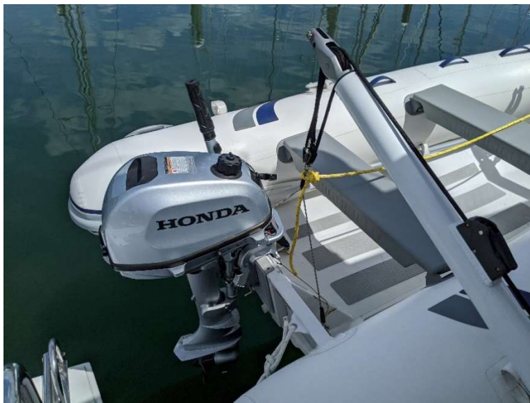
OUTBOARD STAYS ON DINGHY